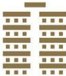
Class Room Style: 50 Delegates