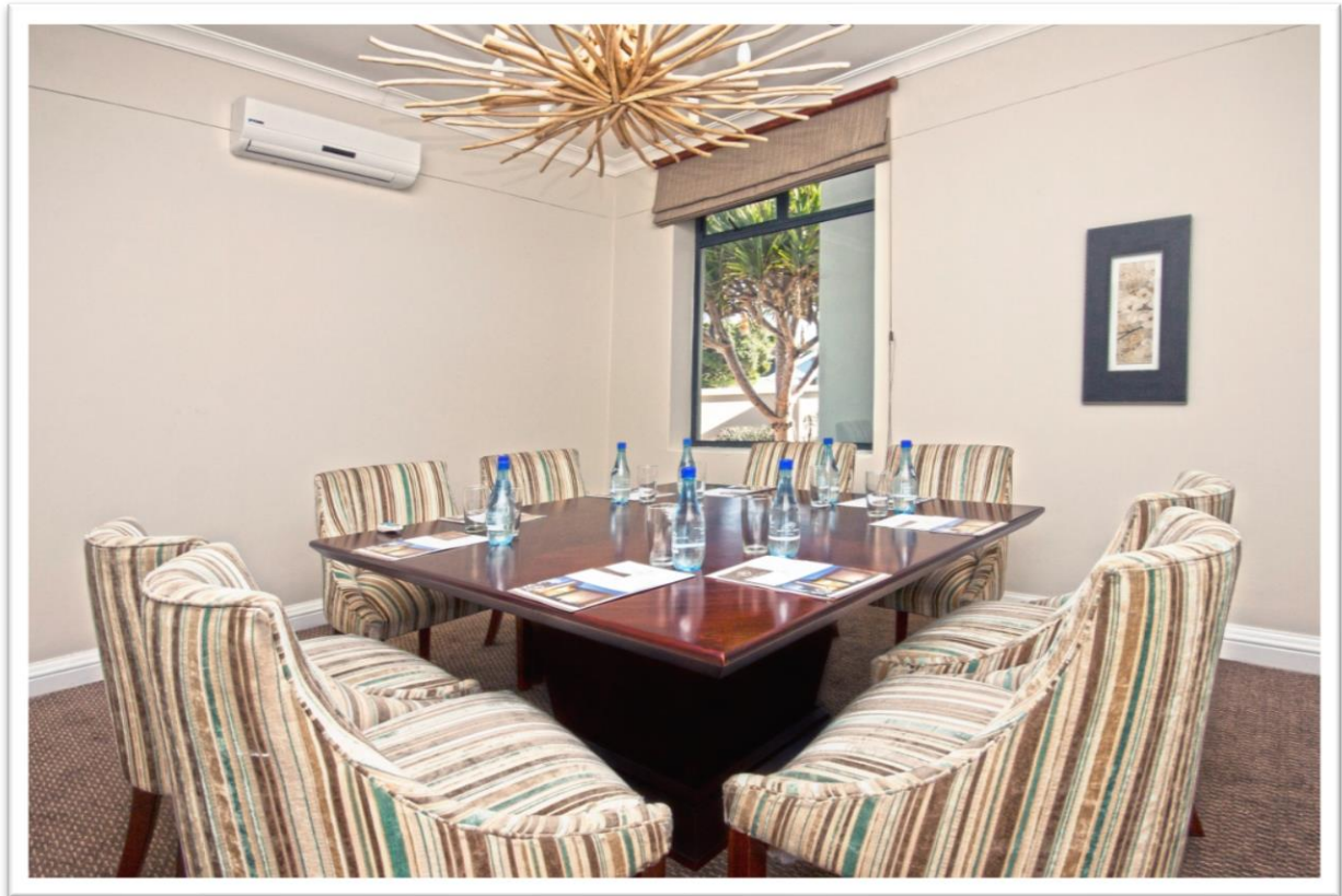
Board Room: 8 Delegates

Any extra equipment or special requests are welcome and can be discussed